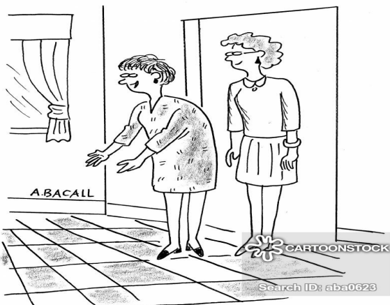
"I installed all the floor tiles by myself. I did it all by tile and error."

BEAUTIFYING OUR CHURCH!! The carpet in the church's reception area (outside our sanctuary to our Fellowship Hall) needs to be replaced. Quotes have been received and your Consistory has approved moving forward. The proposed replacement is a very durable LVT (luxury vinyl tile) product, which will be glued-down and carries a 20-year warranty. The existing carpet will be removed, any wooden subflooring will be replaced, appropriate transition strips will be installed as will new quarter round molding stained to match the current wood base. The quoted price for the described installation is $13,111. The cost for this will be shared with our ELC -- church $6,400 and ELC $6,711. Since our 2019 church budget included $2,000 toward this project cost, an affirmative vote from our Congregation to spend an additional $4,400 will be needed for the work to be begin.